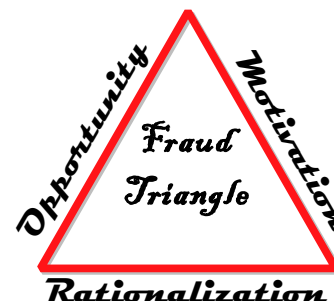
Fig. 1. Fraud Triangle.

Bank Financial Credit is fiscal adroitness permit a someone or commercial enterprise to adopt money and give it back inside the prescribed periods [6]. UU no. 10 of 1998 mentions that the credit is the provision of money or bills can be equated with it, based on agreements between bank lending with another party that obliges the borrowers to refund charge after a certain period of time and gives interest. If someone uses a credit, then it will be subject to interest charges. When banks lend money to customers, the bank certainly expect his money back [2, 5, 7].